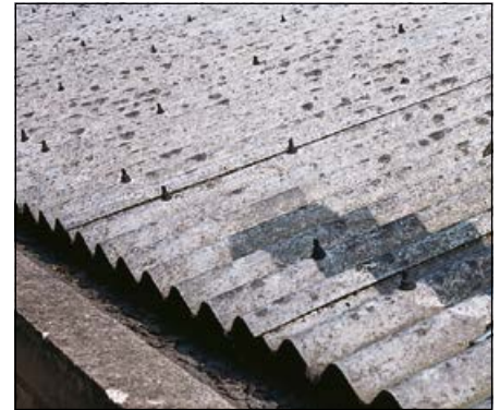
AC sheets used as roofing