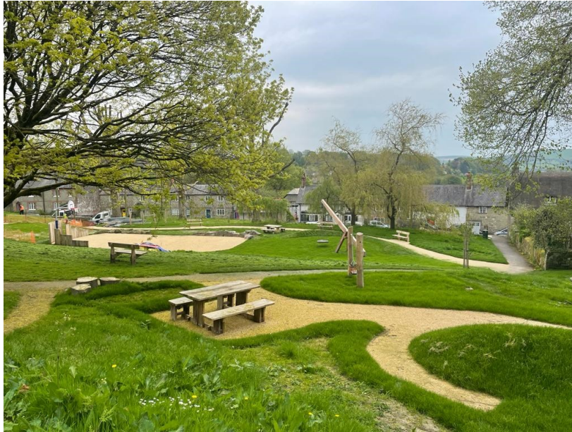
← Picture of the newly installed natural play equipment and landscaping at The Slopes, Shaftesbury