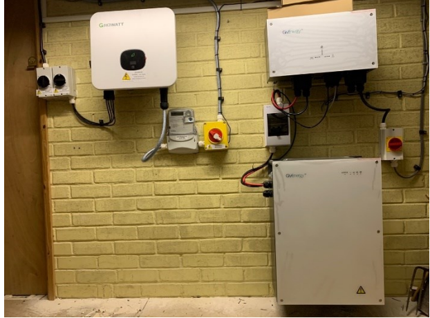
←↑ Pictures of solar panel installation at Milborne St Andrew Village Hall. Picture (left) solar panels, picture (right) battery storage.