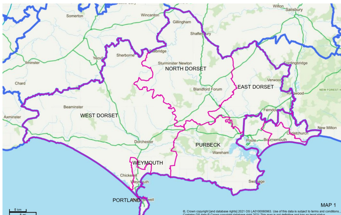
MAP 1 – former administrative area boundaries within Dorset Council.