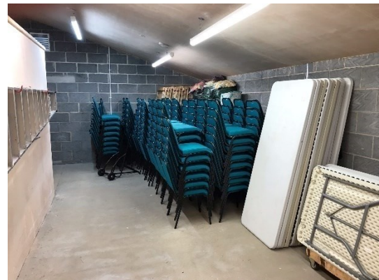
↑ Pictures of the Stalbridge Village Hall extension in use to store equipment, freeing up space within the main hall for events and activities.