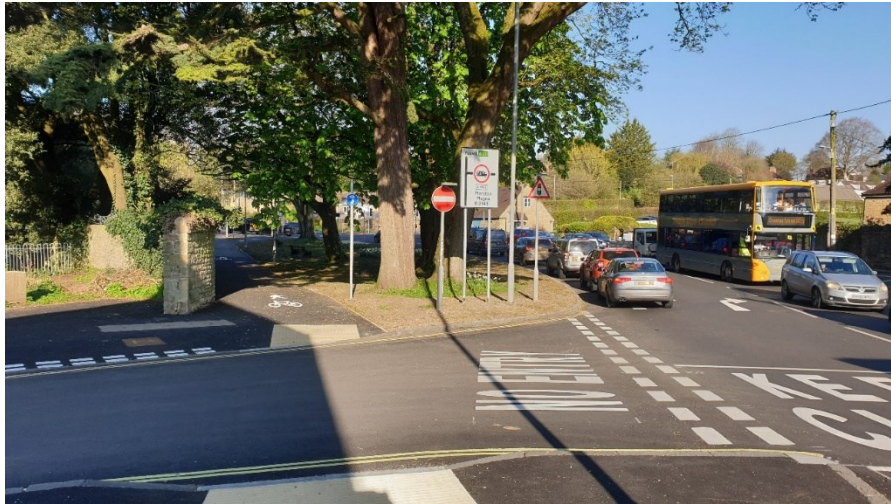
← Picture of highway improvements at the junction of Back Lane and Newell