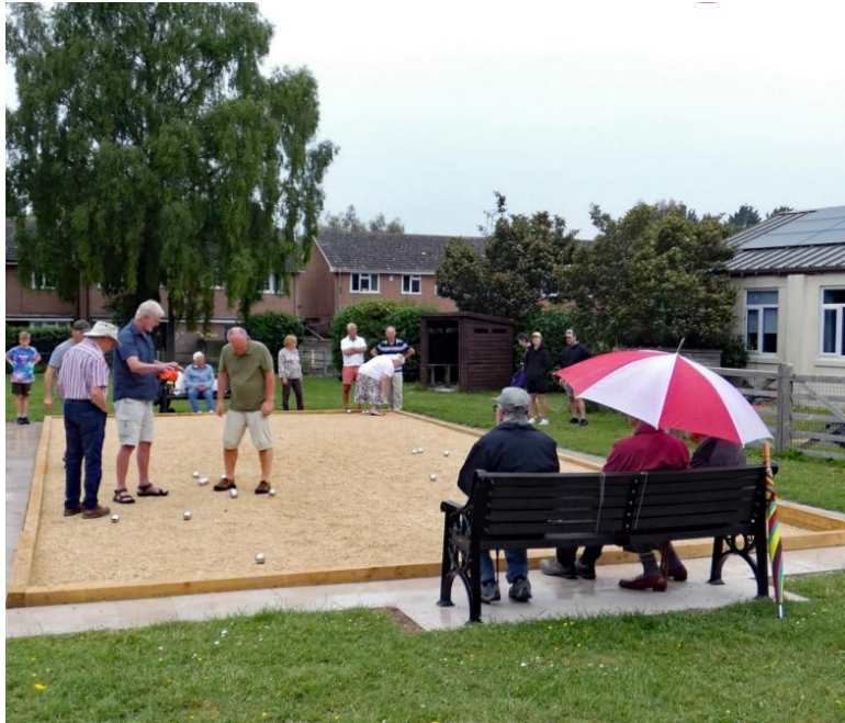
← Picture of pétanque court installed adjacent to the village hall in background.