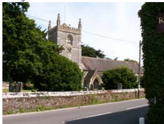
The Church of St Mary The Virgin, a Grade II* listed building

Despite the number of modern houses, which have tended to disrupt the grain and character of the Conservation Area, the area still retains a strong sense of place. There remain a substantial proportion of older buildings of character and the area has preserved its historic street pattern.