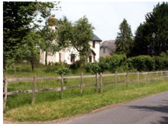
Orchard adjacent to Cottmans

At the south-western extremity of the Conservation Area, 'Cottmans' enjoys the amenities of a large garden and paddock, giving a degree of exclusiveness to this property. The site contains many mature plane, chestnuts, ash and sycamore. On the north side of the house there is an attractive orchard. This feature, together with the informal character of its gardens and backdrop of tall trees, make a significant impact on the amenities of the Conservation Area.