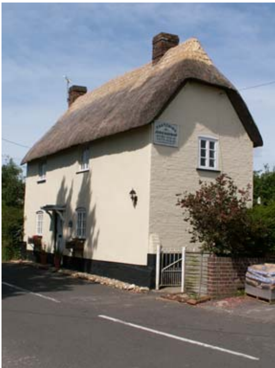
Trafalgar Cottage, A Grade II listed Building

'Riverside House' in Back Lane has brick gables and a rendered front which may conceal a cob structure within. It has a corrugated iron roof, which on the basis of the remnant flashings on the chimney probably replaced a thatched roof. The modern windows also belie its age.