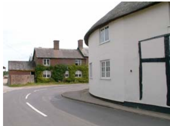
View along Church Street to Church Farm

Modern housing tends to be sited behind front gardens, often screened by hedging. Whilst this differs from the historic pattern of development, the garden spaces and screening effect of the vegetation introduce a softer character to the Conservation Area.