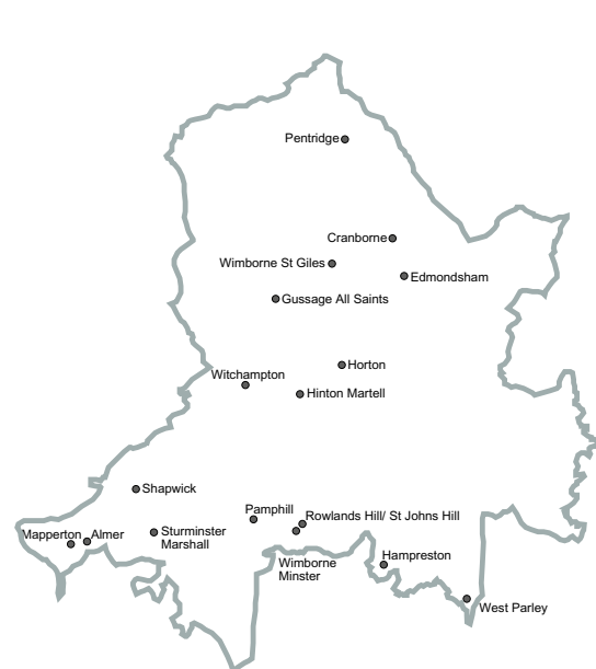
Crown Copyright. East Dorset District Council, Furzehill, Wimborne, Dorset. Licence No.LA086096