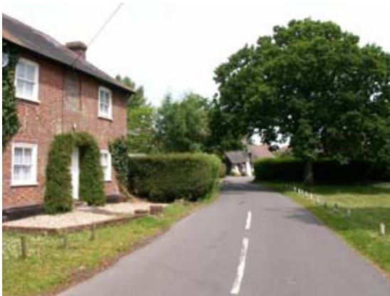
Toliva, Back Lane

'Stour House' has white-washed stuccoed walls. This is a substantial house having classical Georgian proportions and is of considerable architectural quality, though not statutorily Listed. Within its grounds at the rear are attractive brick and slate stables. The property is bounded by high hedges and its entrance features period timber gates.