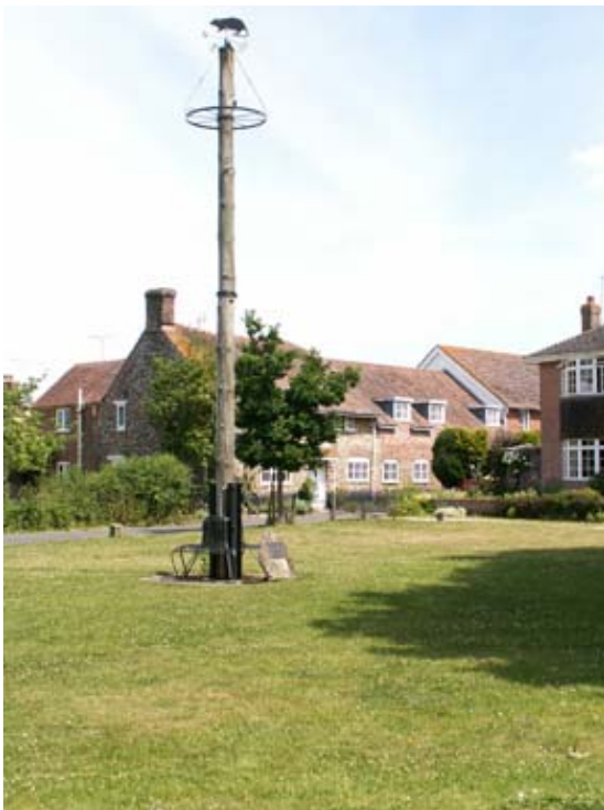
The Maypole in Market Place

Most of the buildings that contribute towards the character of the Conservation Area are sited