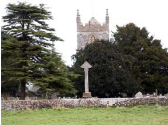
View to the Church from Walnut Tree Field

Between 'Maypole Cottage' and the Methodist Church is a small, informal garden with a frontage onto Front Lane. A public footpath, edged with fencing and hedges, forms its northern boundary. This green space, containing old fruit trees, makes a valuable contribution to the character of the Conservation Area, acting as a foil to the surrounding buildings and allows a clear view of the old stone side wall of Maypole Cottage.