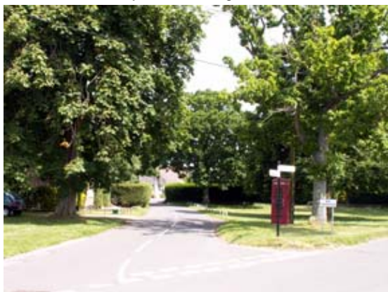
Market Place at the junction of King's Street and Back Lane

The Conservation Area identifies those parts of Sturminster Marshall which, by virtue of its buildings, trees and spaces and other features, are considered to have special character. Within the boundaries are a number of modern houses which in themselves do not contribute towards this character. In such cases, they tend to have at best a neutral effect or are effectively screened by hedging or other greenery. A few modern houses have been included which have an adverse effect on the special character of the Conservation area. This decision was taken to prevent 'islands' of non-Conservation Area occurring within the designated area.