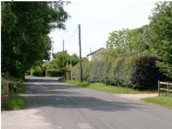
Kings Street looking south west

Hedges are very important as a soft means of enclosure around the various green spaces within the Conservation Area. They close views at eye level and act as green walls. Hedges are particularly important around the two Market Places, the War Memorial corner, Back Lane/Church Street triangular green and at the rear of the Red Lion car park.