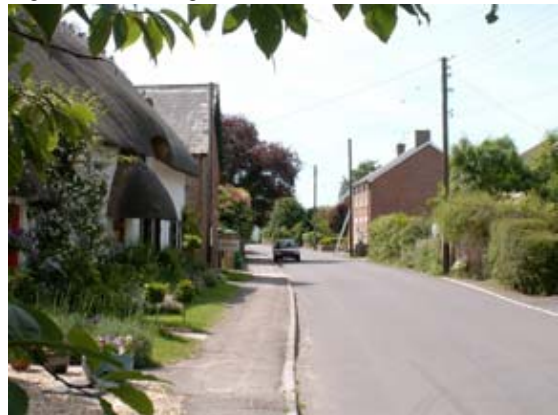
High Street, looking south

The Wareham Forest Way passes through the Conservation Area.