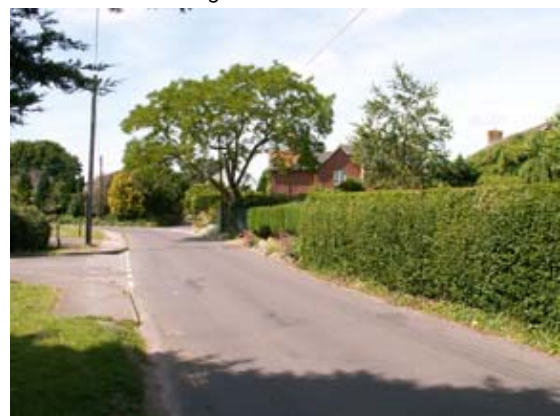
Church Street looking south west

Other trees of individual or group value include an oak tree, opposite Trafalgar Cottage on the