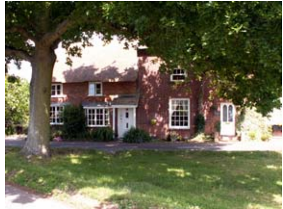
Cherry Cottage & Magnolia House

A newly-constructed house on a plot south of Forge Cottage in Kings Street adopts a similar design code but using render and slate.