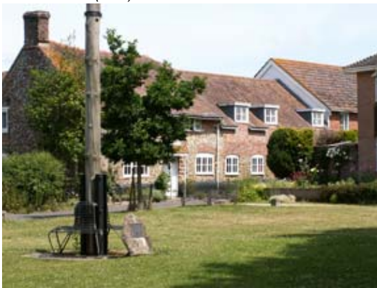
Market Place (east)

Added character is provided by the evergreen Magnolia against 'Magnolia Cottage' in the former Market Place and the garland of evergreen planting around the front door of 'Toliva' in the latter.