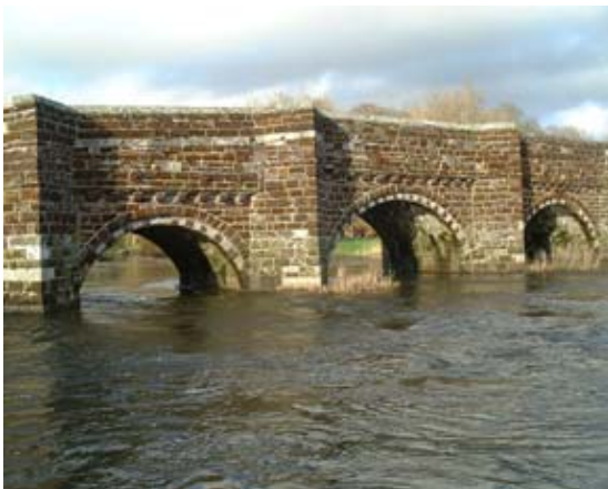
White Mill Bridge, a Grade I listed building

From the south-west, the approach along Newtown Lane is less remarkable, as the outer suburbs of the village have first to be passed through. The edge of the Conservation Area is clearly defined by mature treescape and by a bend in the road which forms a visual pinch-point. The distinctive 19th century buildings of Cottmans on the north side and Stour House on the south side, both set in generous grounds that contain these trees, give this area a refined character not encountered elsewhere in the village. Beyond these properties the Conservation Area is held together by a succession of vernacular thatched cottages to the centre of the village.