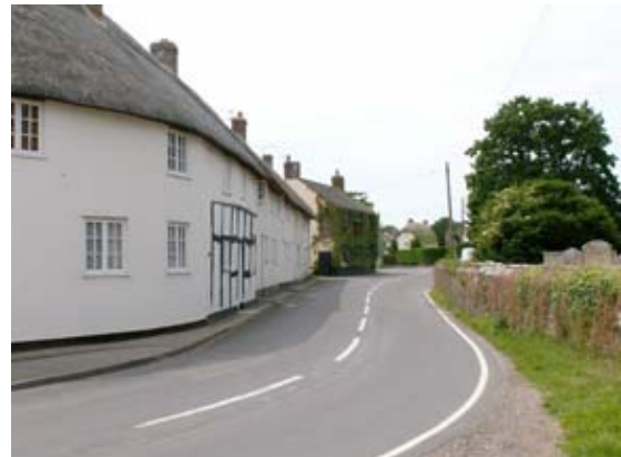
Church Cottages, Grade II listed buildings

A modern row of 'vernacular' cottages, known as 'Meadow Cottages', replaces a 1930's bungalow that stood between the bends at the entrance to the village. Constructed in 1988, this sensitively-designed scheme that features curving rendered walls under a thatched roof, forms one of the first neo-vernacular housing schemes that now characterizes many Dorset villages.