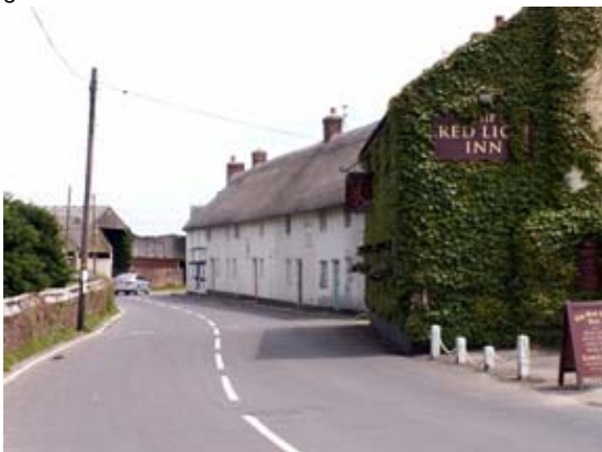
Church Street looking north with The Red Lion in the foreground

The row of cottages that flank the north side of the 'Maypole' Market Place are of high townscape value. Magnolia House, a two-storey brick house built of brick under a slate roof and with formal sliding sash windows has a particularly elegant character. Similar materials are used in the Victorian Methodist chapel on the north side.