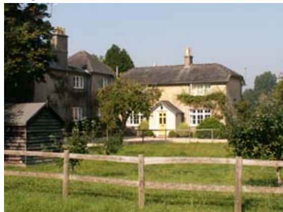
Cottage attached to Cottmans

The approach from the south via High Street is the least remarkable, as this passes through the main built-up area of Sturminster Marshall. Again, it is the character created by mature trees, garden walls and well-constructed 19th century buildings that signal the edge of the Conservation Area. Just beyond this point, the Market Place and Maypole comes into view, symbolically the centre of the village.