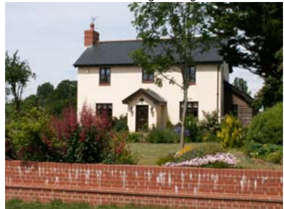
New house south west of Forge Cottage

A number of other Victorian houses feature shallow pitched hipped roofs, such as 'Toliva' (Market Place); 'Stour House' and 'Cottmans' (Kings Street).