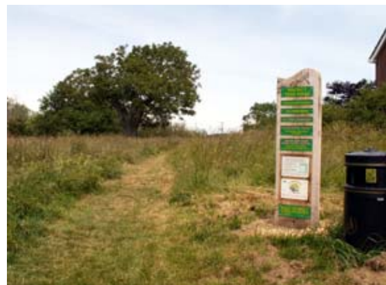
Walnut Tree Field

A single Walnut tree stands in the middle of the field. Many of its limbs are missing - it was badly damaged during the storm of 1987 - and its girth suggests that it is very old. From this point there is a fine view of the Church amidst the churchyard cedars and yews and set off by its foreground of grass.