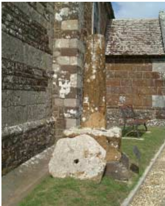
Remains of Cross

Almer Manor was built around 1600. Additions were made to the south wing soon afterwards, but the Elizabethan building has remained largely unaltered since. The building is faced with bands of limestone and flint, though some of the walls are of ironstone. The roofs are of tile with stone slate courses at the verges. The main front of the house faces away from the main road to the north-west. This features a two-storey semi-octagonal porch and a bay window of similar form, with transomed lights. Throughout the house are mullioned windows, many of which have been restored in recent years. This building is also of outstanding architectural interest.