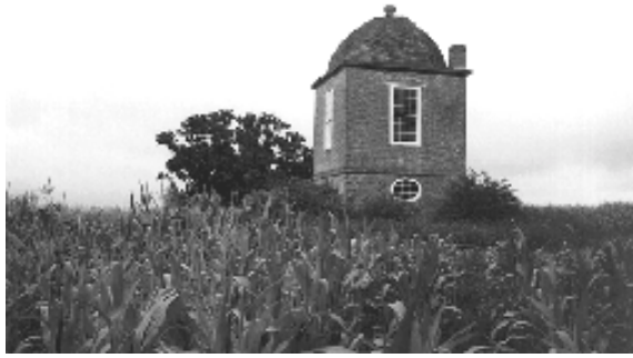
Curiously named the Round House, this 18th Century brick gazebo situated in a field near Wimborne St. Giles has a square plan.

1.20 Although tile-hanging is not an old East Dorset tradition, there are several examples of nineteenth-century use of this practice. It was used for decorative effect, rather than as a functional requirement as evident on many half-timbered houses in Hampshire and the South-East. Early Victorian, hand-made tiles were rich in colour and texture and featured scalloped or fishtail tiles and other distinctive shapes.