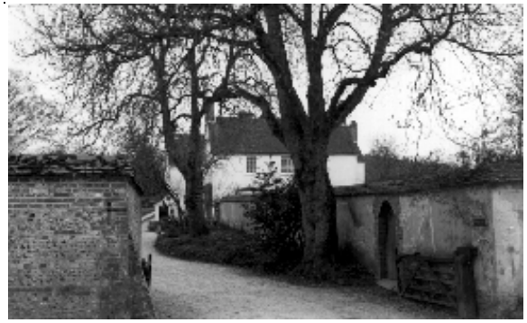
Old tiles used to protect cob walls, sometimes rendered, sometimes faced in brick, add to the rich variety of textures.

1.32 Small, plain tiles represent the most common roofing material in the District. The earliest tiles, which were made in association with the local bricks, were known as 'peg-tiles'. These contained small holes through which oak or sweet chestnut pegs would be inserted in order to hang onto roofing laths. Increasingly, this traditional method of fixing is being replaced with galvanised nails. The external appearance of the roof, however, remains unchanged. The hand-made tiles produce a texture and richness of colour seldom found in the machine-made products that were to follow. Today, old peg-tile roofs are further enhanced by a patina of age and lichen growth, which ought to be preserved wherever possible.