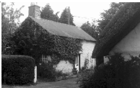
Cob walls containing whole flints at Woodyates. Un-rendered walls are painted white.

1.10 Found in association with Chalk are flints, seen today strewn over cultivated fields, and used in early cottages as a base or plinth for cob walls. In some local areas, cottage walls are constructed entirely of flints. Flints were also used in combination with local Green Sandstone, and later on, with brickwork in alternating bands. Chequer-board patterns may occasionally be found on certain prestige buildings, such as churches and manor-houses. Flints used in this manner were normally split, or knapped, and carefully butt-jointed to give a black, shiny surface. Banded flint-and-brick boundary walls are common in most settlements on the Chalk and make a vital contribution to their character, especially when they are weathered and affected by lichens and mosses. Flint-stones extracted whole from the ground and laid in a less orderly fashion are much less architectural and more rustic in appearance. These too may be used in conjunction with alternating brick layers.