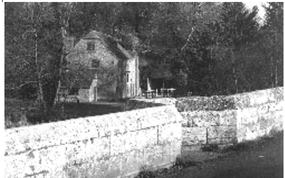
White Mill, Sturminster Marshall, restored in 1994/5 by the National Trust.

1.61 Corn mills have, until the twentieth century, been an important part of the local agricultural scene. Some of the most important trades, millwrights, smiths and farriers, were all dependent on agricultural activity. Walford Mill, Crichel Mill, Didlington Mill, Stanbridge Mill, Witchampton Mill and the mill at Wimborne St. Giles are sited on the Allen, most occupying sites on which earlier structures have stood. Similarly on the Stour, White Mill and the Old Mill at Corfe Mullen occupy much earlier mill sites.