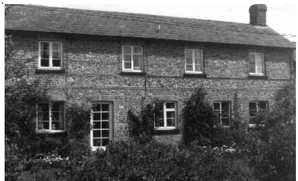
Many slate roofs are characterised by their low pitches and wide soffits. Newtown, Sixpenny Handley.

1.34 Welsh slate became a popular roofing material in villages with easy access to the railways, notably Wimborne, Sturminster Marshall, West Moors, Verwood and Alderholt, but also in some remote parts of the District including a cluster of settlements near Sixpenny Handley: Deanland, New Town and Woodcutts. Many slate roofs have a lower pitch than tiled roofs, often with wider eaves. The material, in common with corrugated iron, is commonly used on mono-pitched roofs for single-storey extensions to thatched or tiled dwellings.