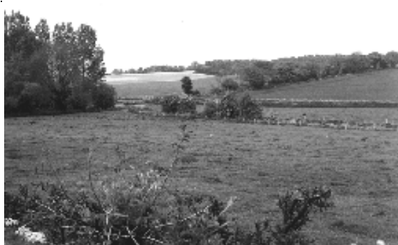
Water meadows of the upper Crane, Holwell.

1.43 For centuries, the landscape of East Dorset was characterised by open downland, with small arable fields or strips leading out from small settlements sited at or near the valley bottoms. The identity and character of the area, however, has been profoundly influenced by historical events.