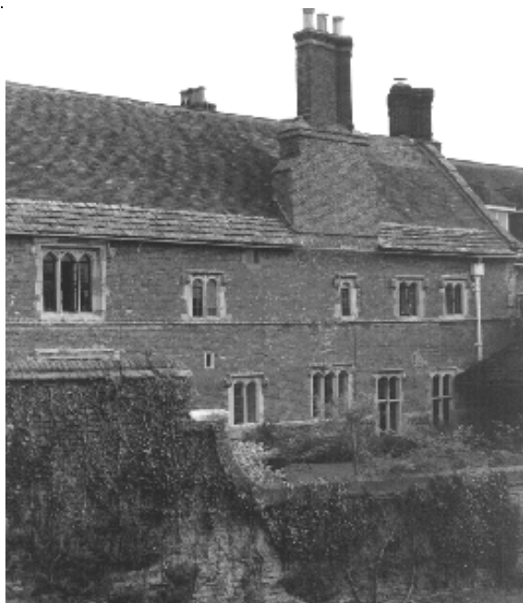
Abbey House, Witchampton.

1.14 The earliest example of the use of brick in the District, indeed within the County, may be seen at Abbey House, Witchampton, which dates from 1500.