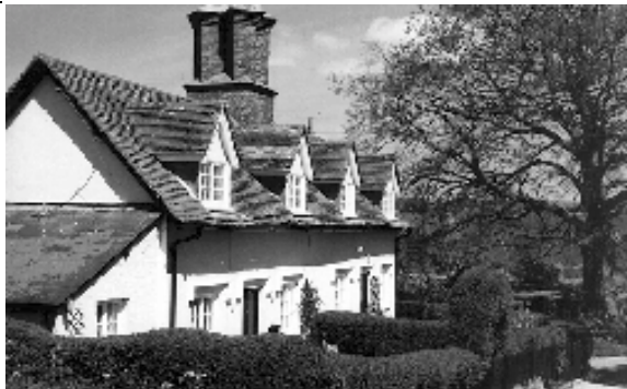
Well preserved Estate houses at Long Crichel.

1.52 Importantly, the estates have safeguarded villages, hamlets and cottages within their jurisdiction and succeeded in preserving their identity and special character. In addition, purpose-built estate houses have been added, mostly in the nineteenth-century, which, by virtue of their form, materials and architectural detailing, have enhanced their respective settlements. There are outstanding examples at Moor Crichel, Long Crichel, Witchampton and Wimborne St. Giles.