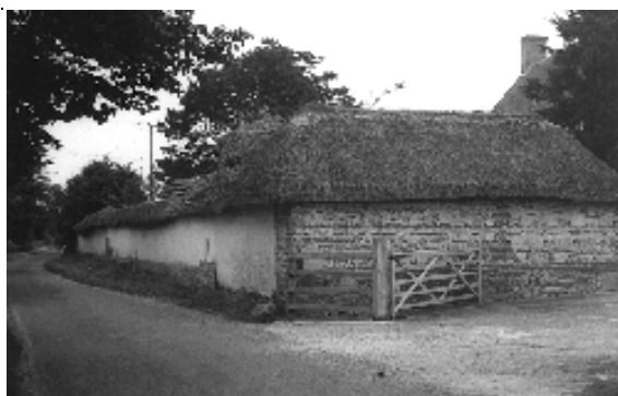
Cob boundary wall protected by thatch 'capping', links harmoniously with brick and flint outbuilding.

1.9 Cob was almost exclusively used in the construction of modest cottages and farm buildings, together with that other highly distinctive roofing material, thatch. High boundary walls were also built in this material, but few of these have survived. It is not uncommon for cob buildings to be later faced with brickwork. Cob buildings and boundary walls make a vitally important contribution to the character and distinctiveness of the District as a whole and to individual settlements in particular.