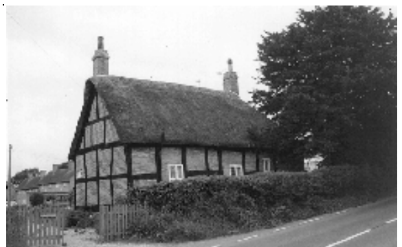
16th Century timber-framed cottages with brick nogging. St. Margaret's Almshouses, near Wimborne Minster.