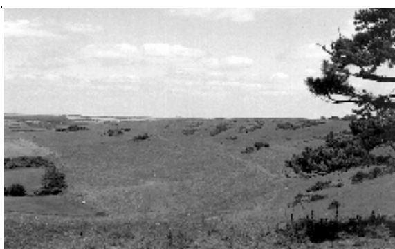
Unimproved Chalk grassland is rare and occurs only on the steepest slopes. (Pentridge Hill).

1.37 The landscape has been influenced by a long and continuous period of human occupation. Except for the highest parts, most of the area was once covered by extensive oak woodlands, but these were progressively cleared for agriculture, house-building and fuel. The light, acidic soils to the south and east of the District became impoverished and, unable to sustain agriculture or woodland, reverted to heath.