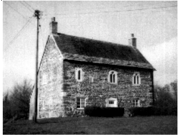
Lodge Farm, a 14th Century, first-floor hall house, with ironstone walls.

1.12 Heathstone, quarried from the Eocene area of the south and east, is a characteristic building material of early churches and important secular buildings, either as rubble-stone or dressed as ashlar. As with Green Sandstone, the material is not extensively seen, but concentrated on relatively few important buildings. Sometimes, Heathstone and other stones may be found in walls of modest cottages. These represent early examples of materials reclamation, often associated with the demolition of earlier priories or manor houses.