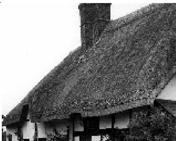
Simple geometric patterns, formed from split hazel liggers, are decorative as well as helping to secure the thatch at the eaves and ridge.

1.29 If the character and distinctiveness of East Dorset are to be preserved it is important that traditional thatching materials and practices should be encouraged. A number of local thatchers now produce their own supplies of wheat reed, using traditional binding and