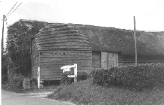
Weatherboarding, Firs Farm Barn and Granary, Cowgrove.

1.21 Weather-boarding is commonly associated with traditional agricultural buildings. Square-edged oak or elm boards are fixed horizontally over supporting timbers, sometimes extending to ground level or more often, above a brick plinth. Weather-boarding is also associated with granaries and other little buildings, and is commonly used to clad cottage out-shuts and porches.