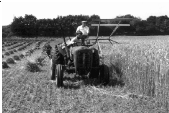
A local thatcher reaping specially grown corn, using a 1910 binder. The stooks will be taken to a nearby barn for threshing before being stored. Horton Heath.

threshing machinery. Growing corn locally ensures adequate supplies of materials when needed, always a problem for thatchers. It also enables the thatcher to control its quality, during the growing stages, at harvesting and subsequent storage.