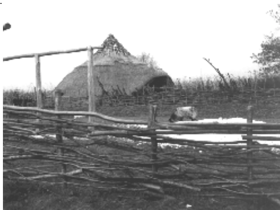
Cranborne Ancient Technology Centre aims to reproduce Iron Age and other early technology and husbandry.

1.38 Since the Iron Age, most human activity occurred on the drier, more fertile Chalk, as small settlements or hill-forts. Badbury Rings represents the largest hill-fort, enclosing some 17 acres. Other settlements, such as Gussage Hill, Oakley Hill, Woodyates and King Down were also sited on hilltops or upper slopes which could be more easily defended.