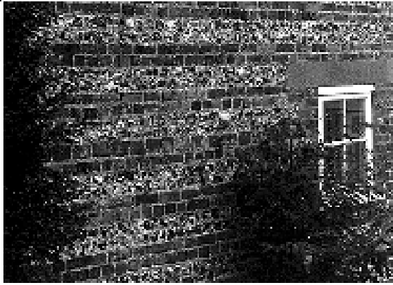
Knapped flint alternating with brick in regular horizontal bands. Apple Tree Cottage, Gussage All Saints.

1.11 Strata of Greensand underlie the Chalk. The nearest small outcrop is at Bowerchalk, exposed as a result of the erosion of Chalk by the River Ebble. In East Dorset, the material is commonly associated with medieval churches, usually in the form of ashlar dressings to rubble or flint walls. There are a few secular buildings with similar architectural dressings. At Long Crichele, the former rectory has complete walls of Green Sandstone. However, unlike certain areas of the County, for instance Shaftesbury, Green Sandstone represents a less familiar building material. Hurdcott Green Sandstone is still available from Teffont Quarry, Chilmark, Wiltshire .