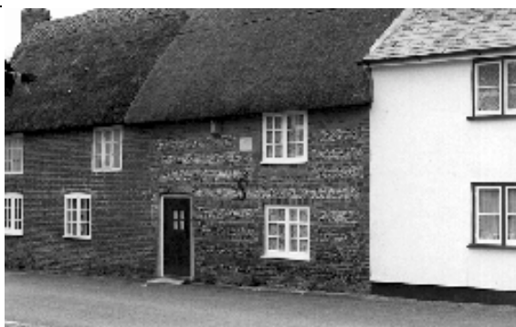
Sometimes when thatch was replaced (perhaps following a fire), the opportunity was taken to increase the height of a cottage at Shapwick.

1.30 Although there are still around 200 Listed Buildings that are thatched in East Dorset, and perhaps as many again which are not Listed, this number represents but a small fraction compared with the situation a century and a half ago. Many cob and thatch cottages have been demolished on account of their poor condition, any defect in the roof would soon affect the condition of the cob walling beneath. Other thatched roofs, including their historic pole rafters, have been destroyed by fire. In the nineteenth-century, thatch was often replaced with clay tiles or Welsh slate as their availability widened and as and when these 'superior' materials could be afforded. To support the new roof, sawn timber rafters would be needed, often supported by a new external skin of brickwork that also served to conceal the cob.