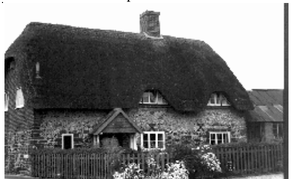
Rubble Heathstone reused in walls of 15 High Street, Sturminster Marshall.

1.12 Heathstone, quarried from the Eocene area of the south and east, is a characteristic building material of early churches and important secular buildings, either as rubble-stone or dressed as ashlar. As with Green Sandstone, the material is not extensively seen, but concentrated on relatively few important buildings. Sometimes, Heathstone and other stones may be found in walls of modest cottages. These represent early examples of materials reclamation, often associated with the demolition of earlier priories or manor houses.