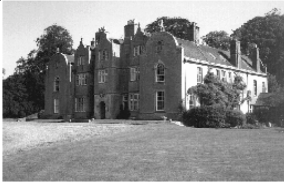
At Edmondsham, as in other Estate villages, parkland bounded by hedges and walls separates the 16th Century house from the village.

1.52 Importantly, the estates have safeguarded villages, hamlets and cottages within their jurisdiction and succeeded in preserving their identity and special character. In addition, purpose-built estate houses have been added, mostly in the nineteenth-century, which, by virtue of their form, materials and architectural detailing, have enhanced their respective settlements. There are outstanding examples at Moor Crichel, Long Crichel, Witchampton and Wimborne St. Giles.