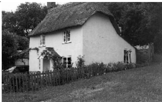
Rendered cob cottage at Dean End, Sixpenny Handley.

Century. The material continued in use until the mid nineteenth-century, when it was succeeded by brick. On the downland areas, Chalk was added to the mixture, either as pure Chalk or as a Chalk aggregate. The raw materials were often dug directly from the construction site and mixed together before building up the walls in a series of layers or lifts, usually without shuttering.