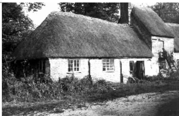
The East Dorset thatching tradition is characterised by smooth, fine textured thatch with a flush, sheared down ridge. Old Forge, Pamphill, before restoration.