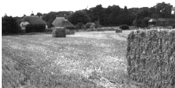
Materials taken from the immediate locality give traditional buildings a strong sense of belonging.

framework comprised split hazel battens fixed to oak trusses.