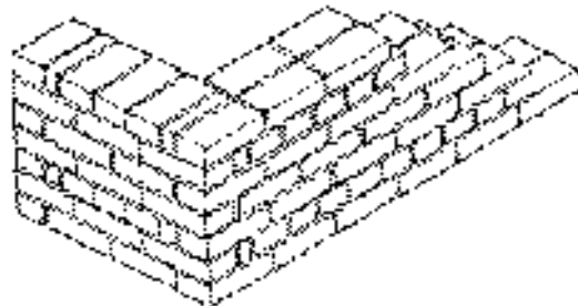
English Garden Wall Bond

timber-framed buildings where a single skin is required, but seldom seen elsewhere. Flemish bond and English Garden Wall are the most common, and Flemish Garden Wall and other variations often occur. Such patterns, as well as a range of capping and other details, give old walls immense character.