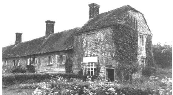
16th Century Chapel at Woodlands Manor Farm, another example of the very early use of brick .

deposits of clay. There were 325 brickyards and tilekilns county-wide, with the main concentration occurring in eastern Dorset, extending southwards from Alderholt to Bournemouth, Poole and Wareham. Brick-making clay is a mix of sand and alumina and may contain chalk, lime, iron oxide or other materials. There are 15 or so different types of clay located in different parts of the County, giving rise to a wide variation in brick colours and textures. Different mixtures, methods of handling and firing techniques resulted in some 60 variations. Most brickworks in East Dorset occurred on London Clay (See paragraph 1.63), producing bricks that had an essentially warm, orange-red colour of soft texture.