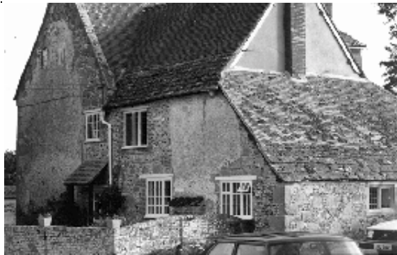
Targetts Farm, Lower Holwell, Cranborne, featuring quoins and stone gable coping, stone tiles, stone

1.31 Although less common than the County as a whole, some early buildings would alternatively, have been roofed in stone tiles, quarried from the Purbeck hills, either as a complete roof, or used in conjunction with thatch. In such cases a narrow margin of stone tiles was used on the verges, overlapped by thatch. The remains of this tradition can still be seen on plain tiled roofs having several courses of stone tiles at the eaves. Some eighteenth-century buildings may have consciously been designed with this detail.