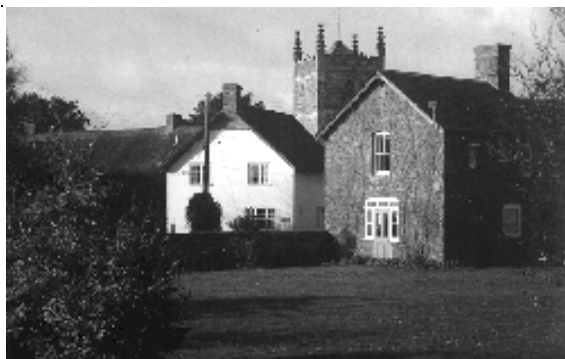
Brick and rendered walls in juxtaposition characterise most East Dorset villages. Farmhouse and cottages near St. Mary the Virgin, Sturminster Marshall.

1.65 Even small amounts of development can make a significant impact on small villages, particularly when its siting, form and design are suburban in character. Some Chalk villages which have been taken out of Estate control, such as Gussage All Saints, have been affected in this way.