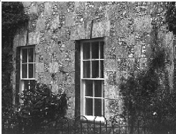
Green sandstone ashlar and knapped flint in chequer board pattern. Manor Farm, Woodcutts.

1.11 Strata of Greensand underlie the Chalk. The nearest small outcrop is at Bowerchalk, exposed as a result of the erosion of Chalk by the River Ebble. In East Dorset, the material is commonly associated with medieval churches, usually in the form of ashlar dressings to rubble or flint walls. There are a few secular buildings with similar architectural dressings. At Long Crichele, the former rectory has complete walls of Green Sandstone. However, unlike certain areas of the County, for instance Shaftesbury, Green Sandstone represents a less familiar building material. Hurdcott Green Sandstone is still available from Teffont Quarry, Chilmark, Wiltshire .