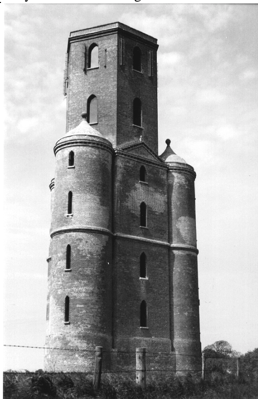
Horton Tower, built for Humphrey Sturt in 1740.

Witchampton. Later, buff coloured bricks were used as dressings around windows, string courses and quoins, a characteristic feature of many Victorian buildings.