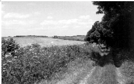
Cobley Farm towards Pentridge

1.2 East Dorset forms part of this image. Whilst the southern extremities of the District are influenced by the Bournemouth-Poole conurbation, most of the District remains as unspoilt countryside. This countryside has certain characteristics which are distinctive to East Dorset. Its landscape is a reflection of the underlying geology and the results of uninterrupted human activity that has impacted on the area since prehistoric times.