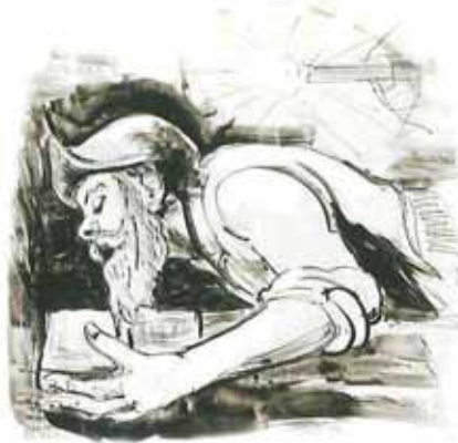
Father's beard jammed by stone

Continue through the village passing the modern quarry on your right until you reach the end of the village – when you reach the 'T' junction turn left, this is the Priest's Way. Walk about 200 metres to the interpretation board, you may like to stop and read it.