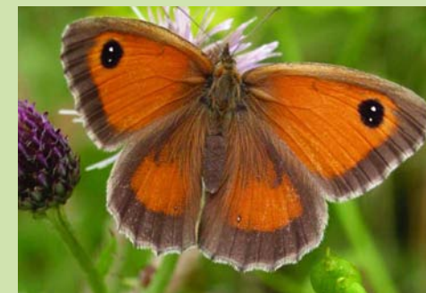
Gatekeeper butterfly: MARK SIMONS

NB: This ride can be done in either direction for variety and can include a visit to the Larmer Tree Gardens.