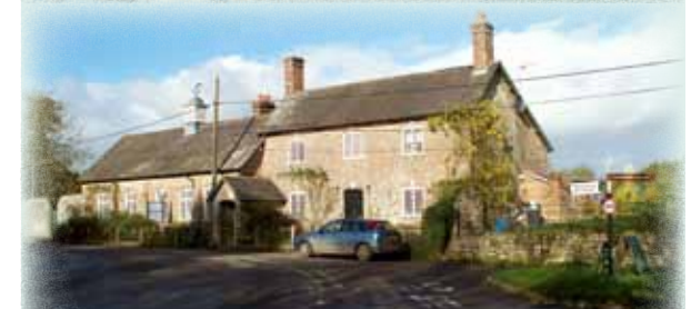
The Old School