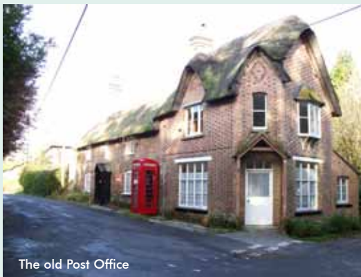
The old Post Office

Forming the heart of one of the District's historic estates, a large part of the conservation area is made up by Moreton Park, the landscaped setting of Moreton House. The village contains an interesting range of vernacular buildings, some of which are located within a planned extension to the settlement laid out during the eighteenth century. Within the main part of the village formal house designs of the same period add diversity and interest. The conservation area includes the burial place of T.E Lawrence.