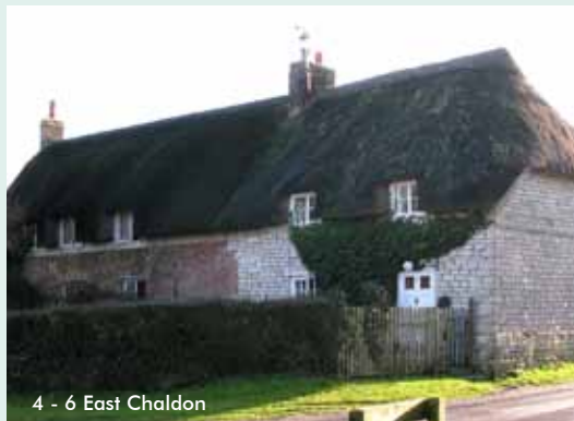
4 - 6 East Chaldon

Chaldon Herring Conservation Area was first designated during 1981. The Conservation Area was reviewed in 2014 and a character appraisal has been adopted.