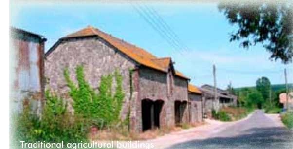
Traditional agricultural buildings