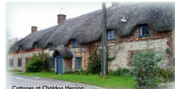
Cottages at Chaldon Herring