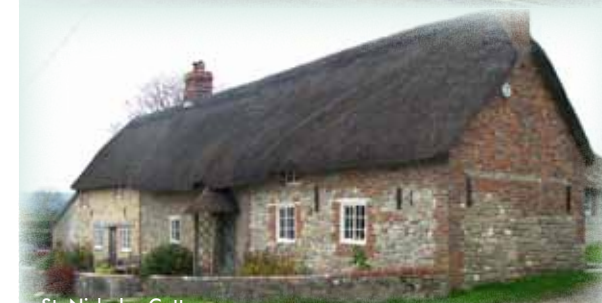
St. Nicholas Cottage